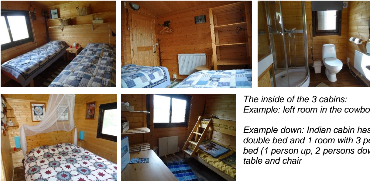
The inside of the 3 cabins: Example: left room in the cowboy cabin, toilet

Attention: we do not have houses complete with a kitchen. But you can use of the cooking cabin (standing behind the camping cabin). You can also order food at our restaurant in the saloon.