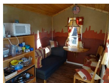
The cooking cabin, available for all our guests that stay over.