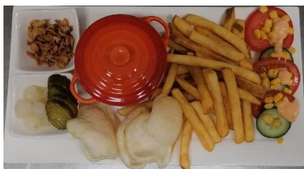
Devils chicken / Devils Oumph