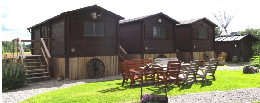
3 cabins with 2 rooms & shower and 1 camping cabin (no shower)

It is possible to hire bedsheets for 100 Sek set, included some towels.