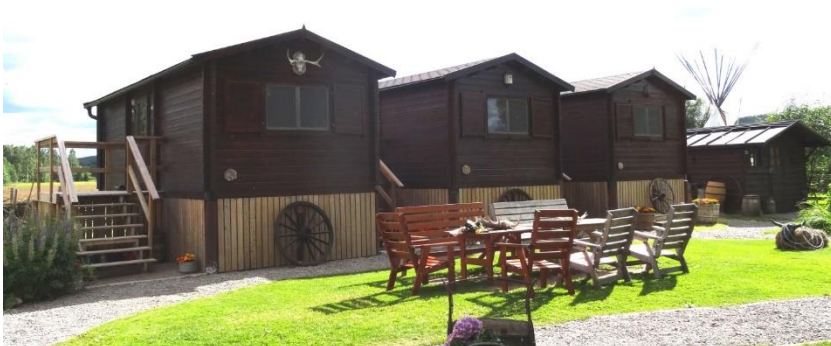
3 cabins with 2 rooms & shower and 1 camping cabin (no shower)

It is possible to hire bedsheets for 100 Sek set, included some towels.