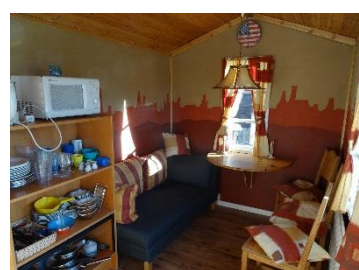
The cooking cabin, available for all our guests that stay over.