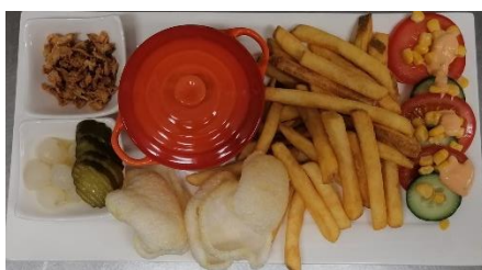
Devils chicken / Devils Oumph