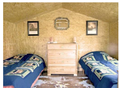
Inside of the camping cabin