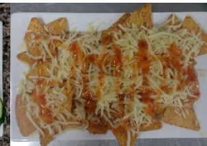
Tortilla chips + cheese